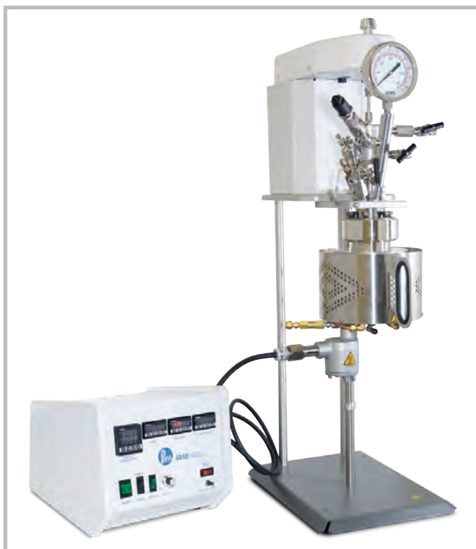
4566 Bench Top Mini Reactor, 300 mL, Fixed Head, with Aluminum Block Heater, and a 4848 Controller shown with optional Expansion Modules.