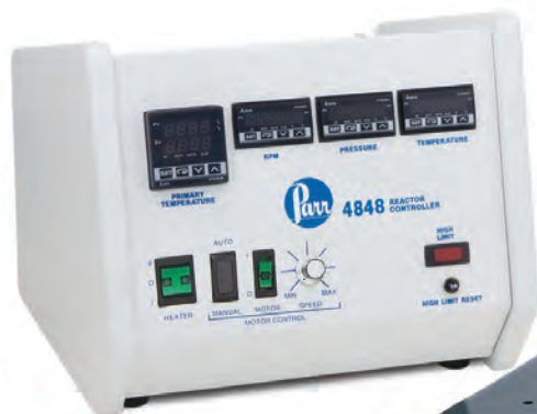
Model 4544 High Pressure Bench Top Reactor, 600 mL, Moveable Head, with heater lowered, and a 4848 Controller shown with optional Expansion Modules.