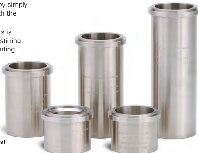
4560 Reactor Vessels from left to right, 300 mL, 100 mL, 450 mL, 160 mL, and 600 mL.