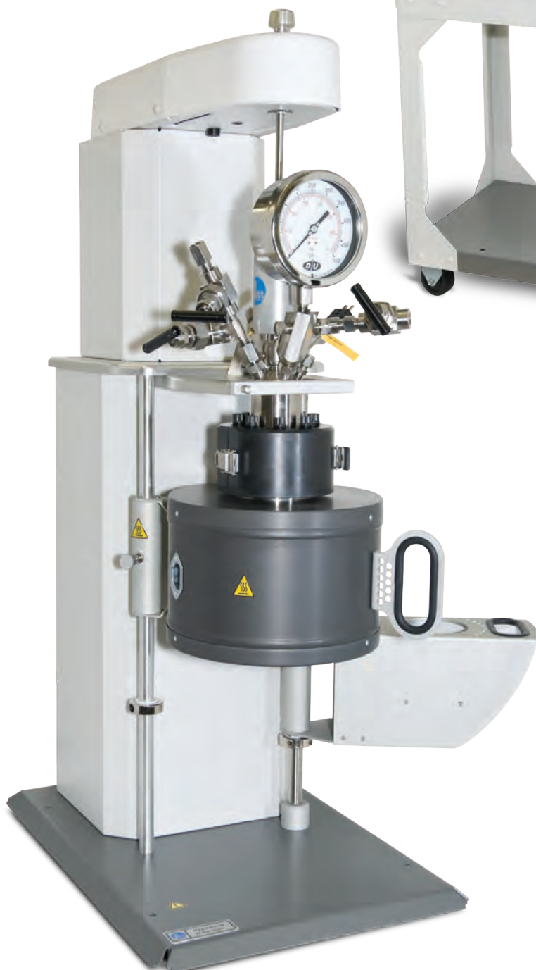
Model 4576A HP/HT Bench Top Reactor, 250 mL Vessel with Fixed Head.