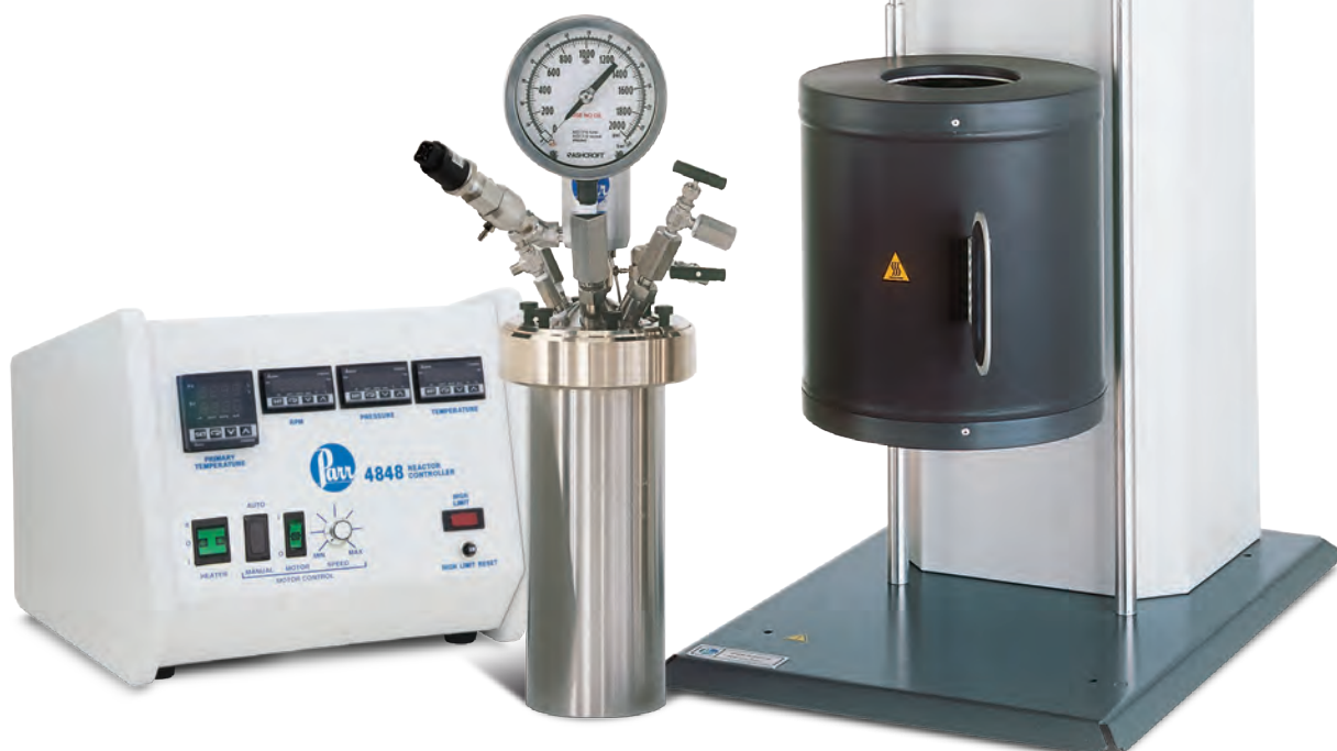
Model 4526 Bench Top Reactor, 2000 mL, Moveable Head, and a 4848 Controller shown with optional Expansion Modules.