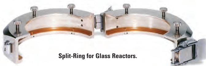
Split-Ring for Glass Reactors.