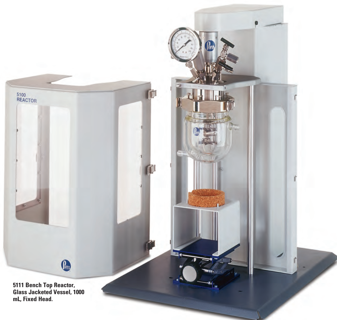
5111 Bench Top Reactor, Glass Jacketed Vessel, 1000 mL, Fixed Head.