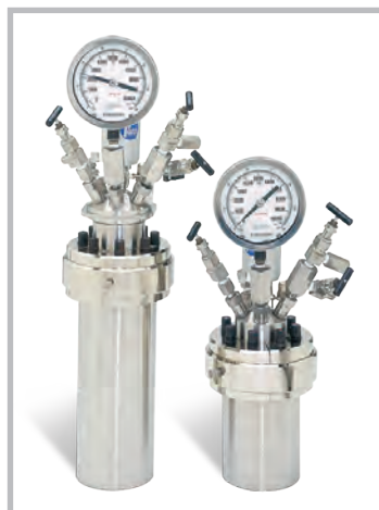
1200 mL Fixed Head, and 600 mL Moveable Reaction Vessels.