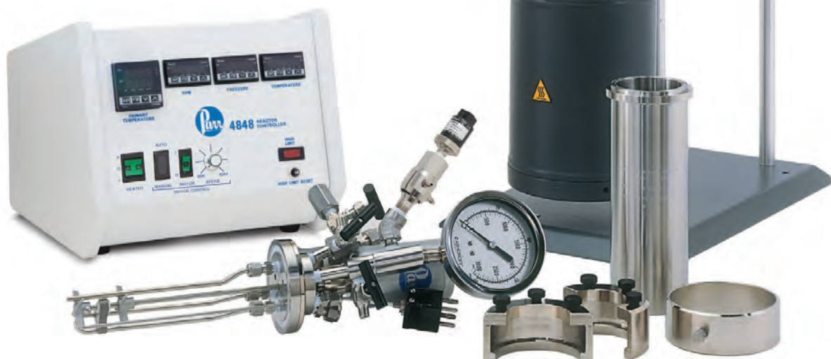
Model 4563 Bench Top Mini Reactor, 600 mL, Moveable Head, PTFE Flat Gasket Seal, with vessel disassembled, and a 4848 Controller shown with optional Expansion Modules.