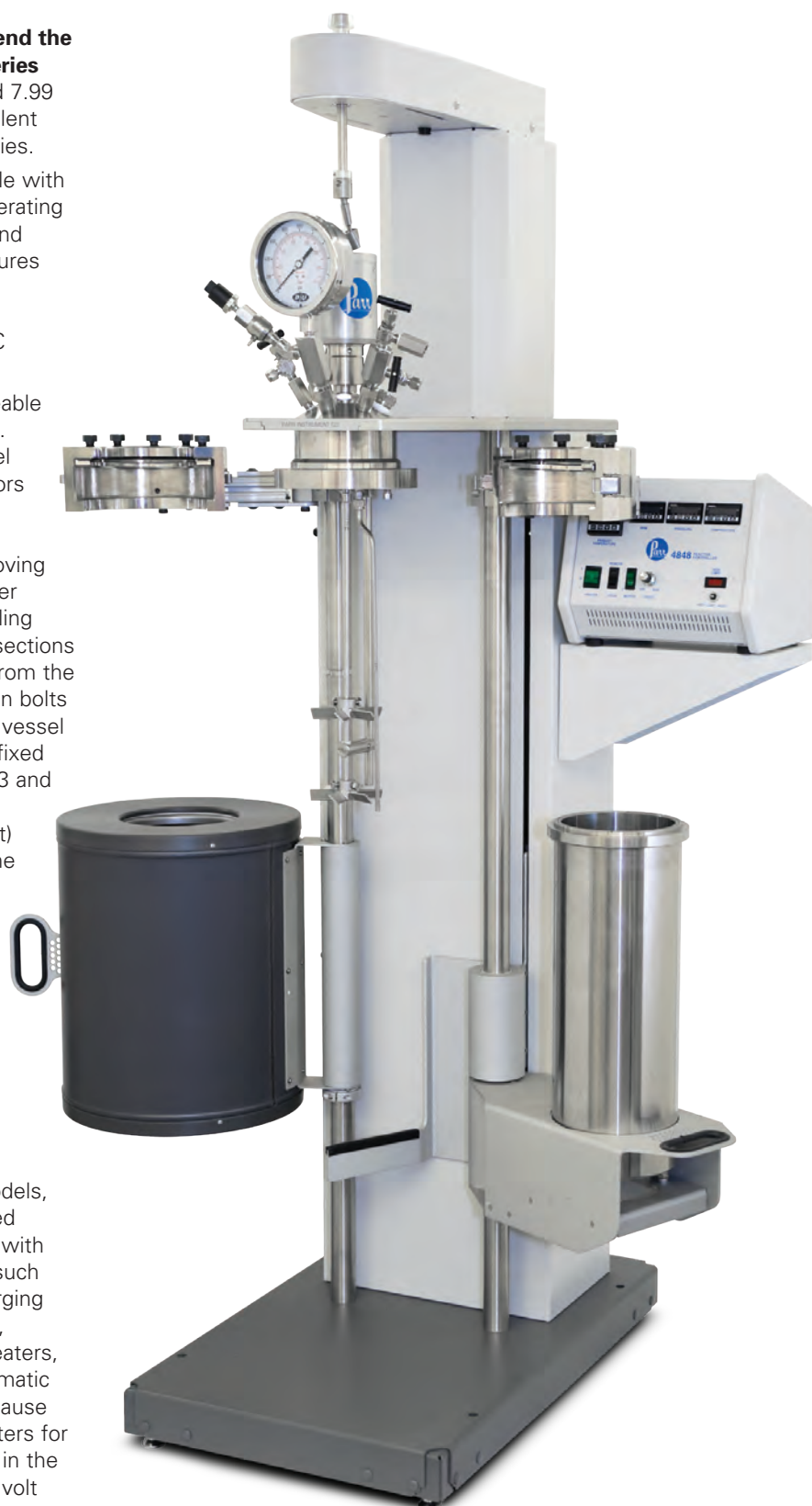
Model 4554 Floor Stand Reactor, Two Gallon, Fixed Head, Pneumatic Lift, Hinged Split-Rings, opened to show Internal Fittings and Serpentine Cooling Coil, with 4848 Reactor Controller shown with optional Expansion Modules.

The 1 gallon size is usually recommended for high viscosity polymer studies. An optional bottom drain valve may be added for convenient product recovery. As with the smaller floor stand models, these larger, self-contained systems can be equipped with a variety of attachments, such as condensers, solids charging ports, bottom drain valves, special motors, custom heaters, jacketed vessels and automatic valves and regulators. Because of the higher wattage heaters for these reactors, all models in the 4550 Series require a 230 volt power supply.