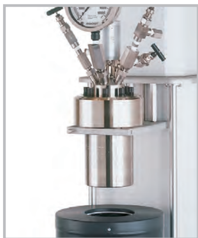
The moveable head is best when the user prefers to remove the entire reactor in one piece after running the operation.