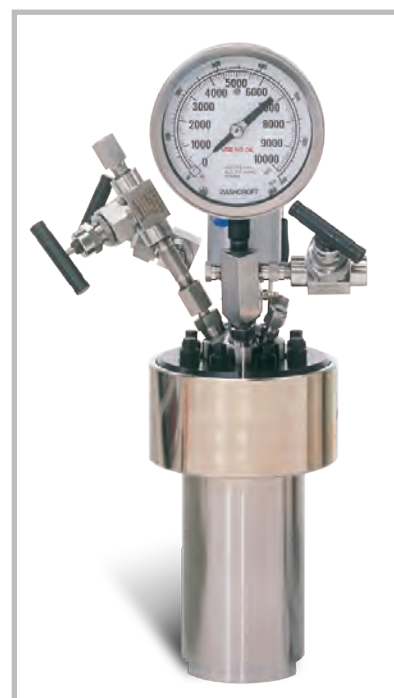
Model 4575B High Pressure/High Temperature 500 mL Moveable Vessel Assembly.