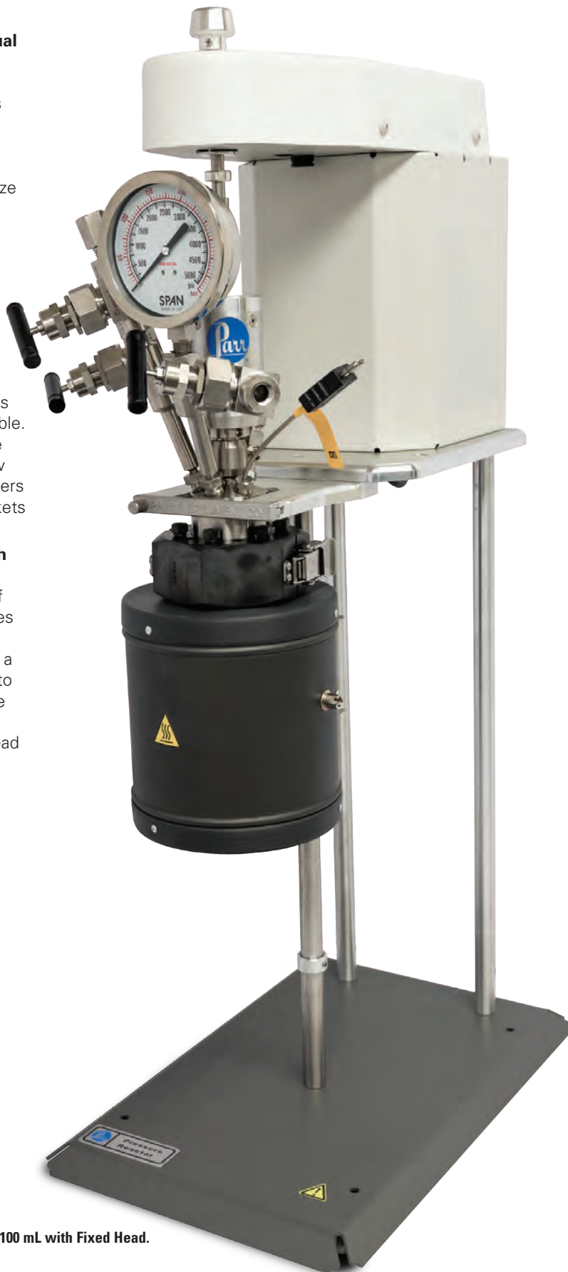
4598 HP/HT Micro Reactor, 100 mL with Fixed Head.

These micro reactors can be easily converted from one size to another by simply substituting a larger or smaller cylinder and the corresponding internal fittings. The support system can also be readily adapted to accept any of the vessels from the 4560 Mini Reactor Series. The opportunity to modify these small reactors is restricted because of the limited head space available.