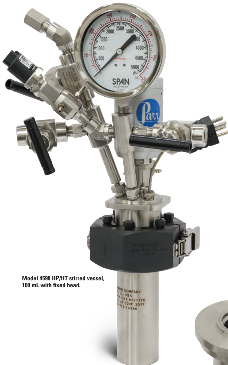
Model 4598 HP/HT stirred vessel, 100 mL with fixed head.