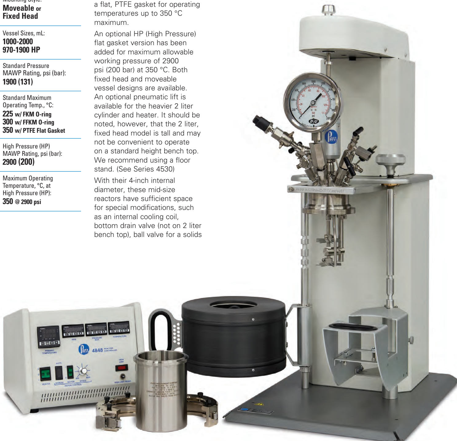
Model 4523 Bench Top Reactor, 1000 mL, Fixed Head, open to show Internal Fittings, and a 4848 Controller shown with optional Expansion Modules.

with viscosities up to 25,000 centipoise. For heavier stirring loads, these reactors can be equipped with larger magnetic drives, more powerful motors, and drive trains capable of delivering additional stirring torque.