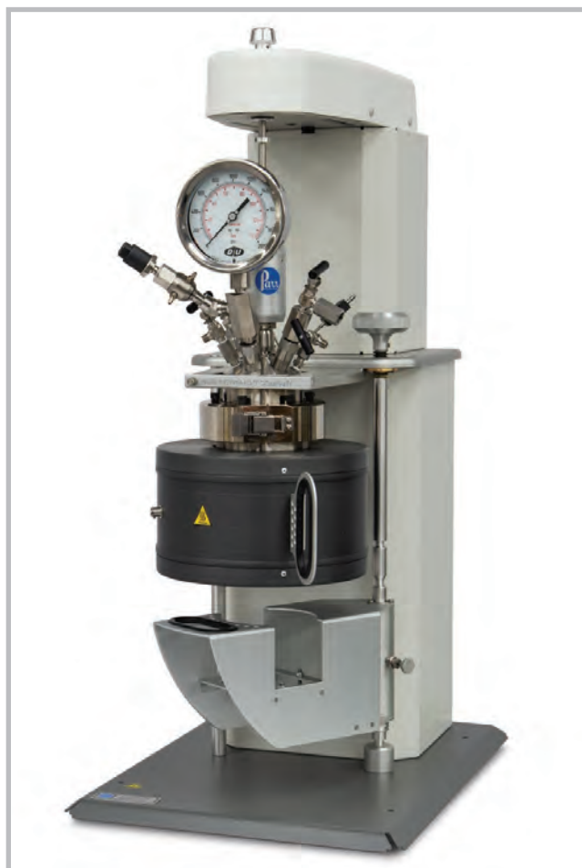
Model 4523 Bench Top Reactor, 1000 mL, Fixed Head