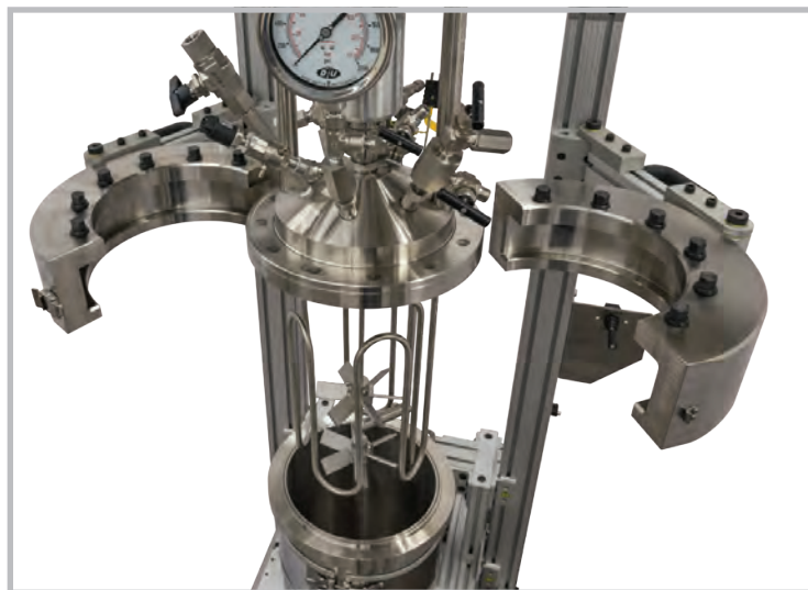
Hinged Split-Rings open to reveal Serpentine Cooling Coil, with Heater and Vessel lowered via Pneumatic Lift.

Modified versions of these units are available with higher working pressures and temperatures.