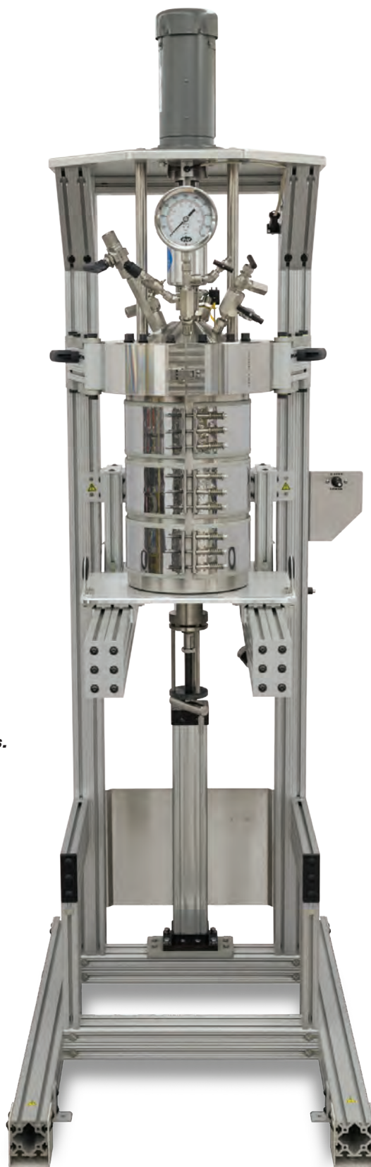
4557 Floor Stand Reactor, 5 Gallon, Fixed Head, 3-zone Band Heater, with Split-Rings and Pneumatic Lift.