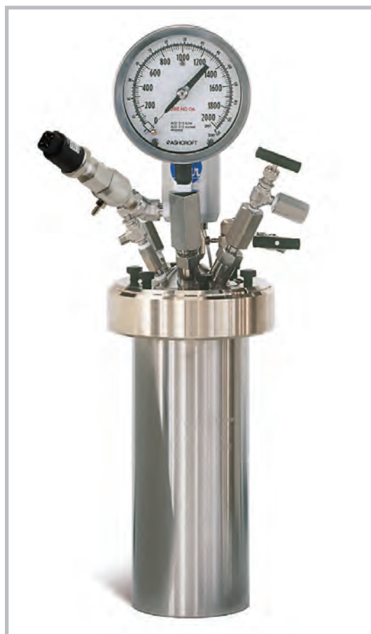
2000 mL Moveable Vessel