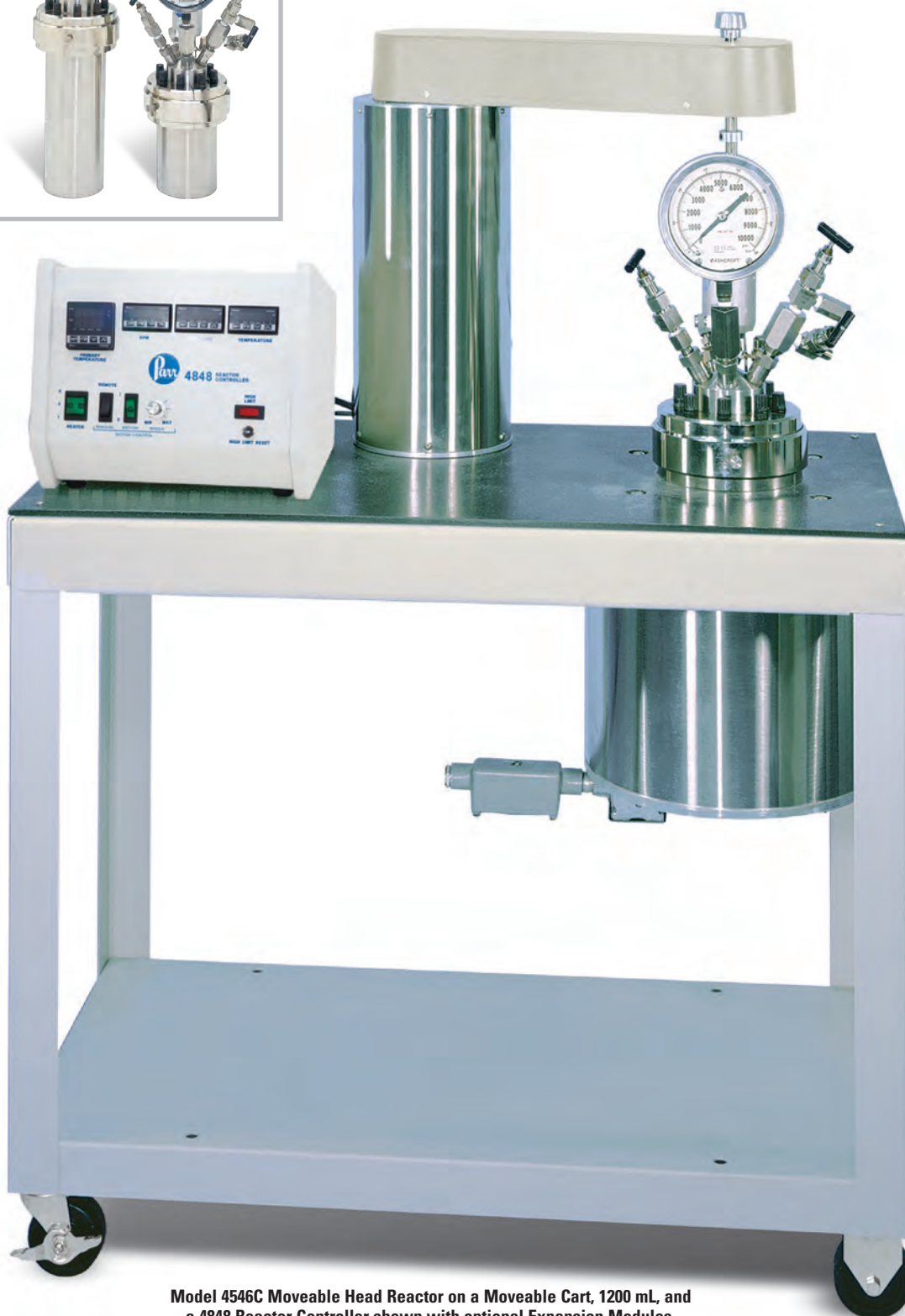
Model 4546C Moveable Head Reactor on a Moveable Cart, 1200 mL, and a 4848 Reactor Controller shown with optional Expansion Modules.