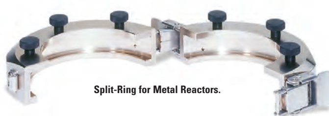
Split-Ring for Metal Reactors.