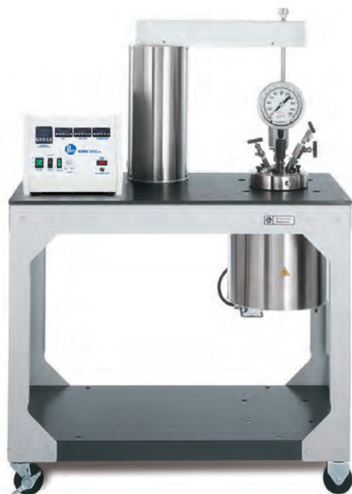
4532 Moveable Head on Moveable Cart, 2000 mL, and a 4848 Temperature Controller with optional Expansion Modules.