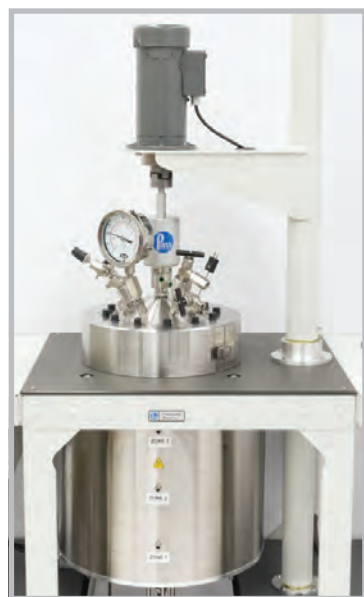
5 Gallon Stirred Vessel in stand with stirrer engaged.