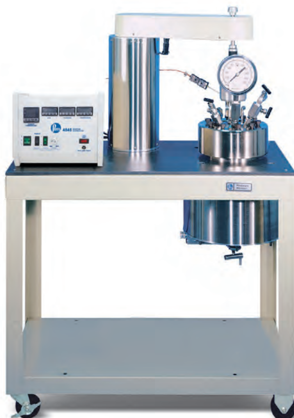
4551 Moveable Head Reactor on Moveable Cart, 1 Gallon, with Bottom Drain Valve, and a 4848 Temperature Controller shown with optional Expansion Modules.

The innovative Parr Hinged Split-Rings on the 4553 and 4554 add to a safe vessel removal routine. Simply loosen the compression bolts, unlatch the split-ring closures, and pivot the split-rings out of the way.