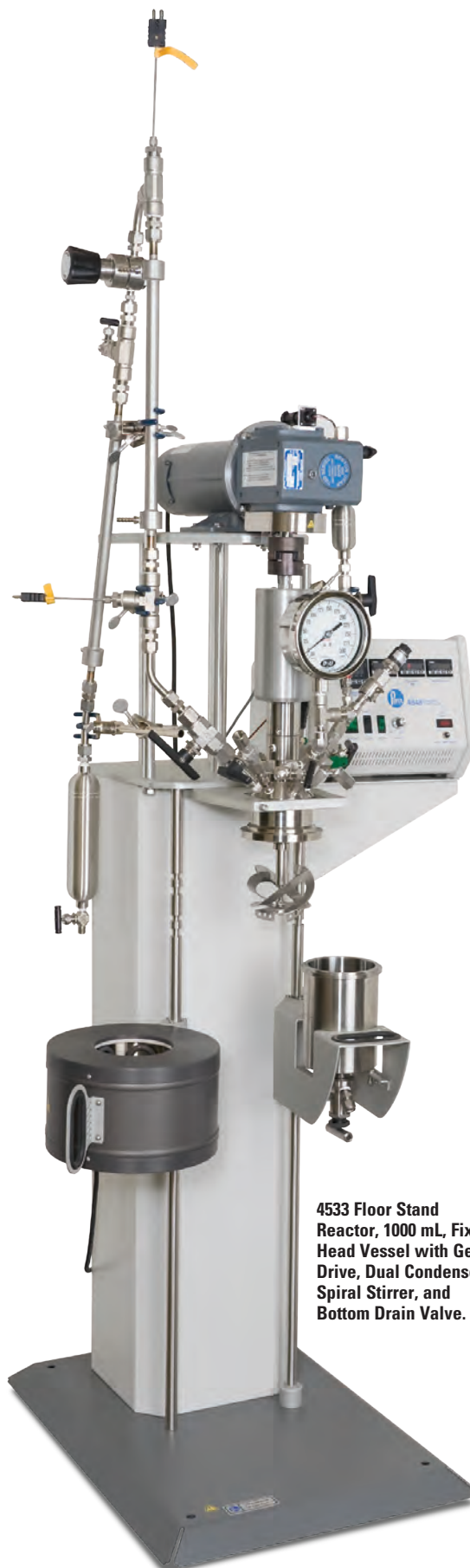
4533 Floor Stand Reactor, 1000 mL, Fixed Head Vessel with Gear Drive, Dual Condenser, Spiral Stirrer, and Bottom Drain Valve.