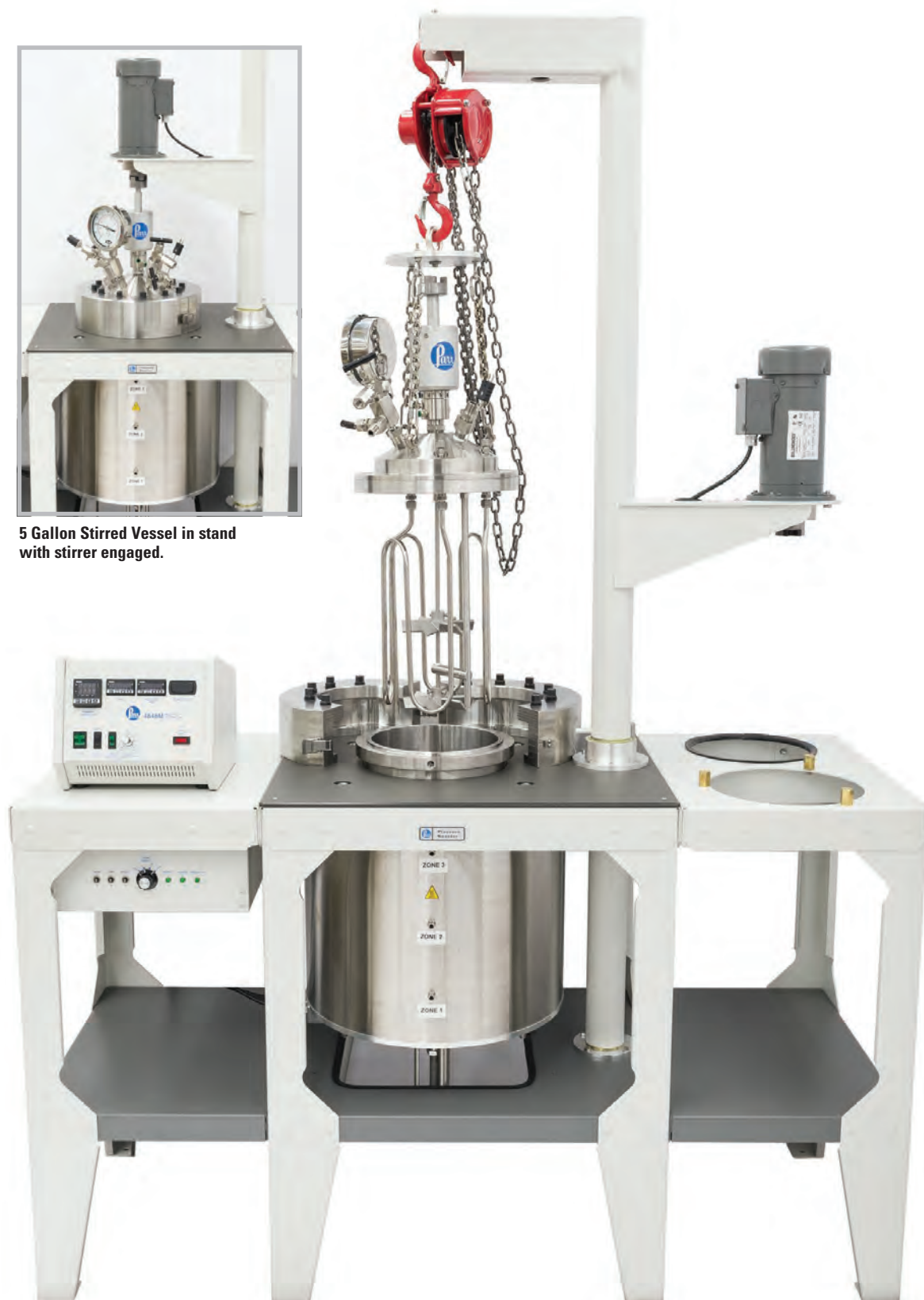
4555 Table Floor Stand Reactor, 5 Gallon Moveable Vessel with Head removed from Vessel, Manual Hoist, and a 4848M Controller.