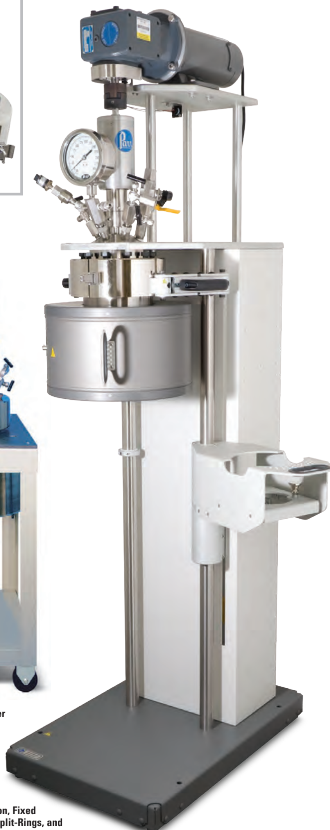
4553 Floor Stand Reactor, 1 Gallon, Fixed Head, with Gear Drive, Hinged Split-Rings, and heater engaged.