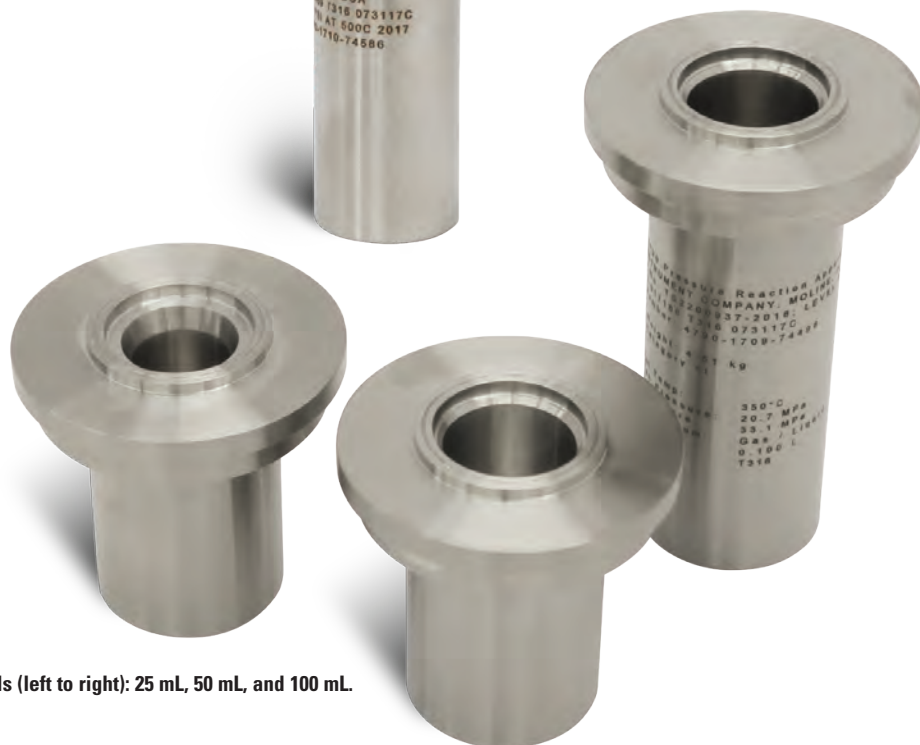
4590 vessels (left to right): 25 mL, 50 mL, and 100 mL.